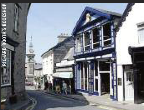
RICHARD BOOTH'S BOOKSHOP

The countryside is known as the Welsh Marches , a medieval term used to describe the border country between England and Wales. By any standards this has to be the greenest and most pleasant of any part of the UK. The town of Hay is now famous for the annual literary festival which attracts over 200,000 visitors and untold numbers of famous authors talking about their latest publications. This year it's from May 26 to June 5. The town itself is very attractive, with 30 book shops selling, they say, over one million books although it's unlikely that anyone has ever counted. The original and largest of the bookshops is Richard Booth's Bookshop , which is well worth visiting even if books aren't your thing as they have a really excellent café. There are many unusual little shops, not all selling books and plenty of places to eat well at surprisingly